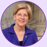
Senate Bill Sponsor Sen. Elizabeth Warren (D-MA)